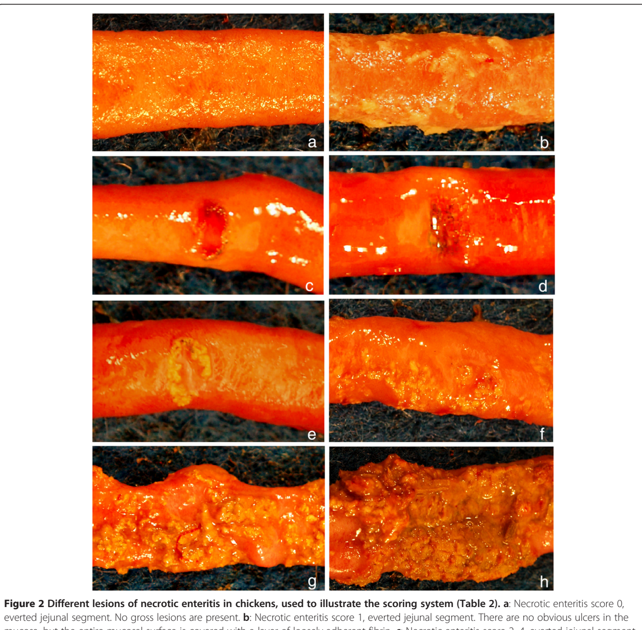
Figure 2 Different lesions of necrotic enteritis in chickens, used to illustrate the scoring system (Table 2). a: Necrotic enteritis score 0, everted jejunal segment. No gross lesions are present. b : Necrotic enteritis score 1, everted jejunal segment. There are no obvious ulcers in the mucosa, but the entire mucosal surface is covered with a layer of loosely adherent fibrin. c : Necrotic enteritis score 2–4, everted jejunal segment. There is an excavated ulcer of the mucosa with acute, bright red hemorrhage within the ulcer bed and scant crusting of fibrin around the periphery. d : Necrotic enteritis score 2–4, everted jejunal segment. There is an excavated ulcer of the mucosa with dark green-black pigment within the ulcer bed and scant crusting of fibrin over the surface. e-f : Necrotic enteritis score 2–4, everted jejunal segments. There are excavated ulcers of the mucosae, the periphery of which are covered by thick, tightly-adherent layers of fibrin, necrotic tissue, and inflammatory cells. g-h : Necrotic enteritis score 5–6, everted jejunal segment. The mucosae are covered by large, confluent plaques of fibrin, necrotic tissue, and inflammatory cells ( g ) to the point where they extend over broad regions of the intestinal mucosa ( h ).

people work together to score the lesions. Figure 2 shows some of the variability in the gross lesions associated with NE, and the scores to which they would be assigned.