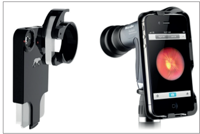
Figure 2. Magnifi photoadapter for iPhone ( www.arcturuslabs.com ) and iExaminer PanOptic Ophthalmoscope ( www.welchallyn.com )

The use of smart phones for ophthalmic photography has become increasingly popular. New generation of smart phones has cameras with resolution of 5 mega pixels and higher, which enables its users to capture high quality images. There are several photoadapters available for smart phones which make them useful ophthalmic devices for taking images of both, anterior and posterior eye segment (Picture 2). When used, photoadapters require that the smartphone's camera is aligned with the optical axis and placed close enough to the slitlamp eyepiece. There are adapters designed to attach to the "PanOptic Oph-