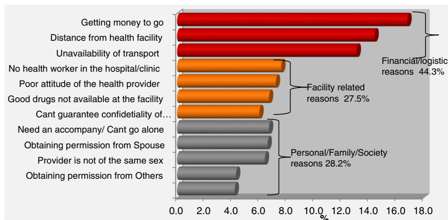
Figure 2 Contributions of each reason to all reasons given for not attending ANC.

Previous studies have recommended that for the ANC coverage in developing countries to match the coverage in most developed countries, the ANC services should be made free and available especially in rural settings [2,21,23,29], with at least one ANC facility within every