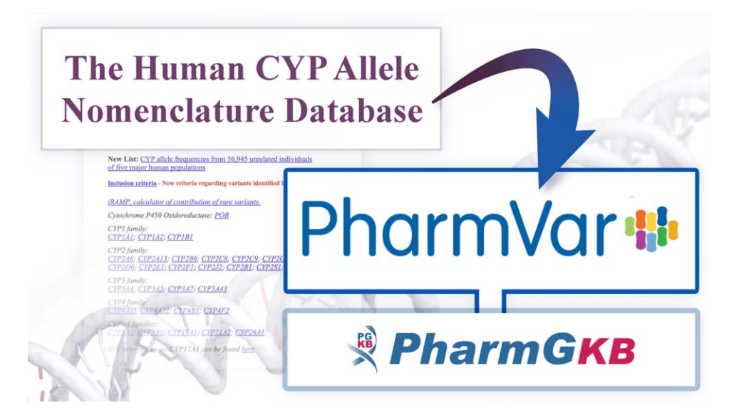
Figure 1 The Human Cytochrome P450 (CYP) Allele Nomenclature Database has transitioned to the Pharmacogene Variation Consortium (PharmVar). PharmVar will closely work with the PharmGKB for data curation and dissemination.