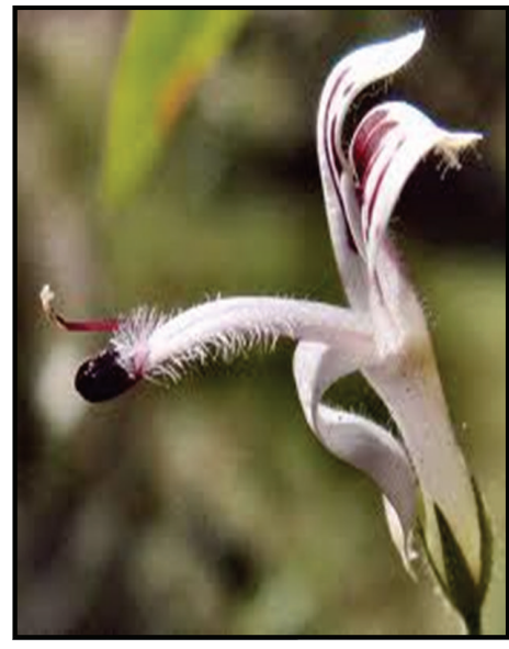
Figure 1: Morphology of Andrographis paniculata.