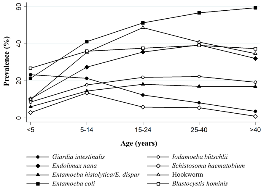
Figure 3. Age-prevalence curves of investigated parasites. The results of the intestinal protozoa and helminth infections arise from the baseline cross-sectional survey carried out in July 2011 among community members of two villages and seven hamlets in the Taabo health demographic and surveillance system, south-central Côte d'Ivoire. Trichuris trichiura , Schistosoma mansoni and Ascaris lumbricoides are not displayed due to very low prevalence.