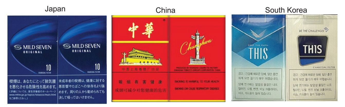
Figure 1 Representative warning labels on cigarette packages in Japan, China and South Korea. Japan front (in Japanese): Smoking increases the risk of worsening your emphysema. (Detailed information is available at the MHLW website, http://www.mhlw.go.ip/topics/tobacco/main.html). Back (in Japanese): Smoking among minors increases adverse health effects and tobacco dependence. You should not smoke even if urged to do so by the people around you. China front (in Chinese): Smoking is harmful to your health. Quitting smoking early is good for your health. Back (in English): Smoking is harmful to your health. Smoking can cause respiratory diseases. South Korea front (in Korean): Warning: Smoking is harmful to your health. Once you start, it is very difficult to quit. Tobacco smoke includes carcinogens such as naphthylamine, nicotine, benzene, arsenic, and cadmium. Back (in Korean): Same as the front label.

been affirmed. The support among Japanese people for partial rather than complete bans on workplace and public place smoking is likely to reflect the effects of the large-scale media campaigns by Japan Tobacco Inc (JT), emphasising the coexistence of smokers and non-smokers.