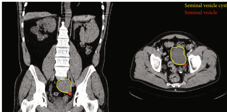
FIGURE 2: CT, axial, and coronal sections from scan in 2004, of a more inferior aspect of the cyst (outlined in yellow), identifying its relationship to the seminal vesicle (outlined in red).

vesicle on that side (Figure 2). This CT also showed some prominence of the right ureter but without a cause for obstruction. Micturating cystourethrogram (MCUG) was not performed during the initial nephrology consultations; thus, reflux could not be absolutely confirmed as the cause of the CKD. As the patient was asymptomatic at the time of initial diagnosis, a decision was taken to defer intervention until only such time that he did become symptomatic. No specific radiological follow-up regimen was followed, although the patient had regular clinical and physical examinations. There was an approximate 80% increase in the volume of the cyst over the 14-year time period, leading to a large lesion occupying the pelvis and precluding safe transplantation of a donor kidney.