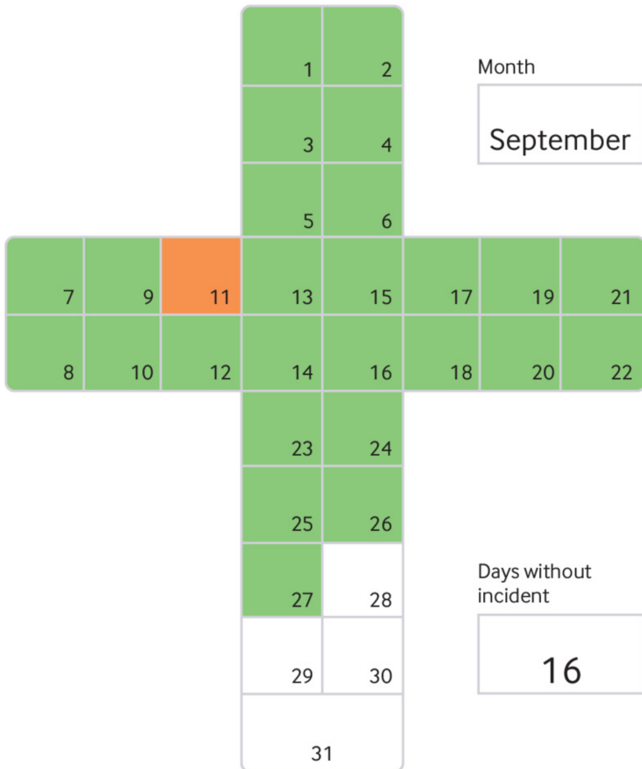
Fig 3 Example of a safety cross in use