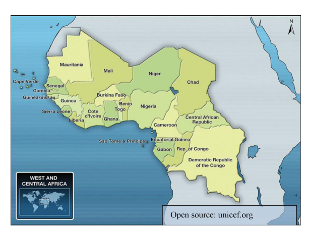
Figure 1. Map of West and Central Africa.

The international community has recently noted that classifications of the HIV epidemic based on prevalence data often limit understanding of the complexity of transmission and appropriate prevention strategies. However, concentrated epidemics have historically been defined as occurring in countries where HIV prevalence is consistently higher than 5% in at least one subgroup within the population, but less than 1% in antenatal clinics [7,9]. These subgroups are generally considered to be female sex workers (FSWs), men who have sex with men (MSM) and people who inject drugs (PWID) [7,13]. There is less clarity around mixed epidemics, although these are generally agreed to be low-level generalized epidemics ranging from 2 to 5% HIV