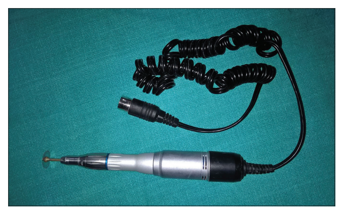
Figure 3: Micromotor (marathon) with wheel shape bur

wheel shape bur which is used as a dental instrument without any kind of anesthesia [Figures 2-4]. The skin entrapped underneath was protected by a metal blade to avoid injury. The area was continuously irrigated by cold saline to prevent from thermal injury generated during the procedure. Penile edema was significantly decreased, and he was discharged on next day. On follow-up after 7 days, his penis was healthy with normal erections [Figure 5].