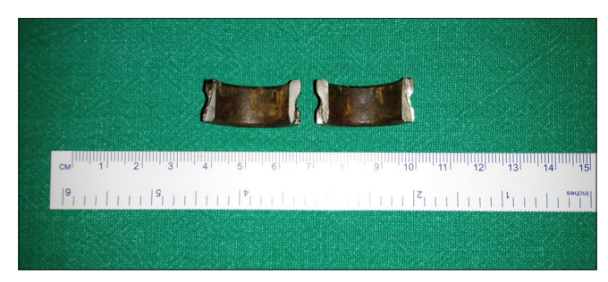
Figure 4: Metal ring cut into two pieces

should be managed urgently.<sup>[4]</sup> Penile entrapment by metal ring if left untreated can result in ischemia, necrosis, and amputation of the penis. The reported motives for placing a metal incarcerating device include enhancement of sexual response, erectile dysfunction self-treatment, and psychiatric disturbance.<sup>[5]</sup>