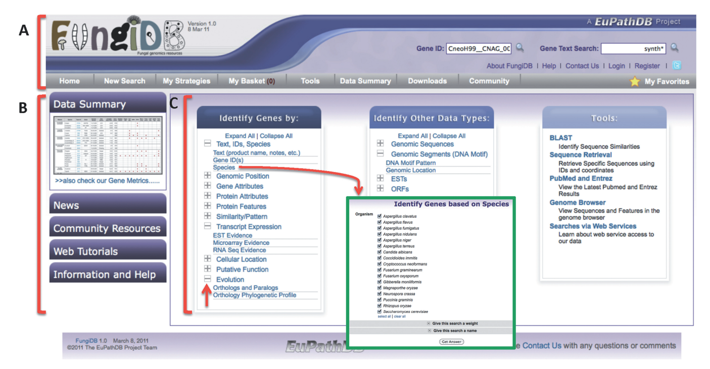
Figure 1. Screen shot of the FungiDB home page. (A) The banner section present on all FungiDB webpages provides links to registration, login, and contact us forms, ID and text searches, information and help, and all available searches and tools. (B) The side bar provides expandable tabs with information such as a data summary table, community events, news, tutorials and help links. (C) The central portion of the home page contains three sections, the left column contains searches that return genes, the middle column contains searches that return other entities such as genomic sequence, ESTs, DNA motifs and the third (right column) section contains tools such as BLAST, sequence retrieval and web services. The plus symbols can be expanded to reveal specific searches (upward pointing red arrow). Green insert is an example search page following selection of a 'genes by species' search.

in the right-hand column of Figure 1C, including access to the GMOD genome browser (30), BLAST (31), the sequence retrieval tool, access to web services searches and a list of fungal-related literature (based on PubMed searches).