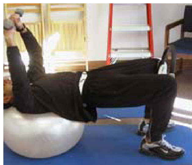
Figure 2 Bridging with shoulders on a ball.