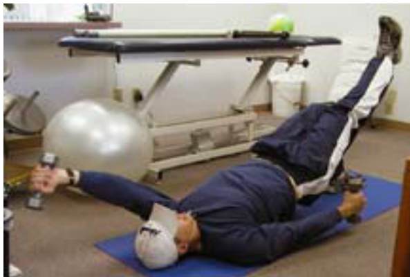
Figure 1 Keeping the transversus abdominus contracted and using the upper and lower extremities.