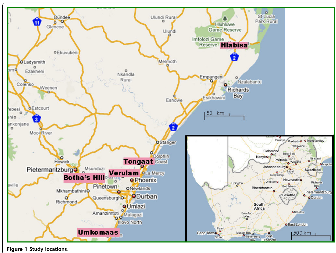
Figure 1 Study locations.

Analysis identified three hotspots or clusters of prevalence, and these included 458 cases (19% of all) recruited at two study sites: a less urbanized clinic in Botha's Hill and a peri-urban clinic in Umkomaas. These three hotspots were determined to be areas of particularly high prevalence when compared with other study sites (Verulam, Tongaat, Hlabisa and Durban) (Figure 2).