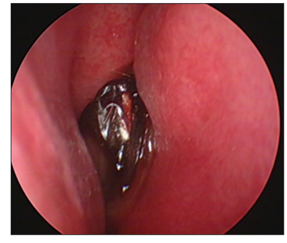
Figure 1: Endoscopy results. The bilateral middle concha and nasal septum had a scattered, dark purple or black scab and necrosis (white arrow). The suspected fungal infection was histologically confirmed as a Mucor

(48.1%) of mucormycosis. The fungal culture (30/81 cases, 37%) revealed that 22 cases were positive (73.3%), including 18/30 cases (60%) of Mucor , three cases of Rhizopus , and one case of Aspergillus .