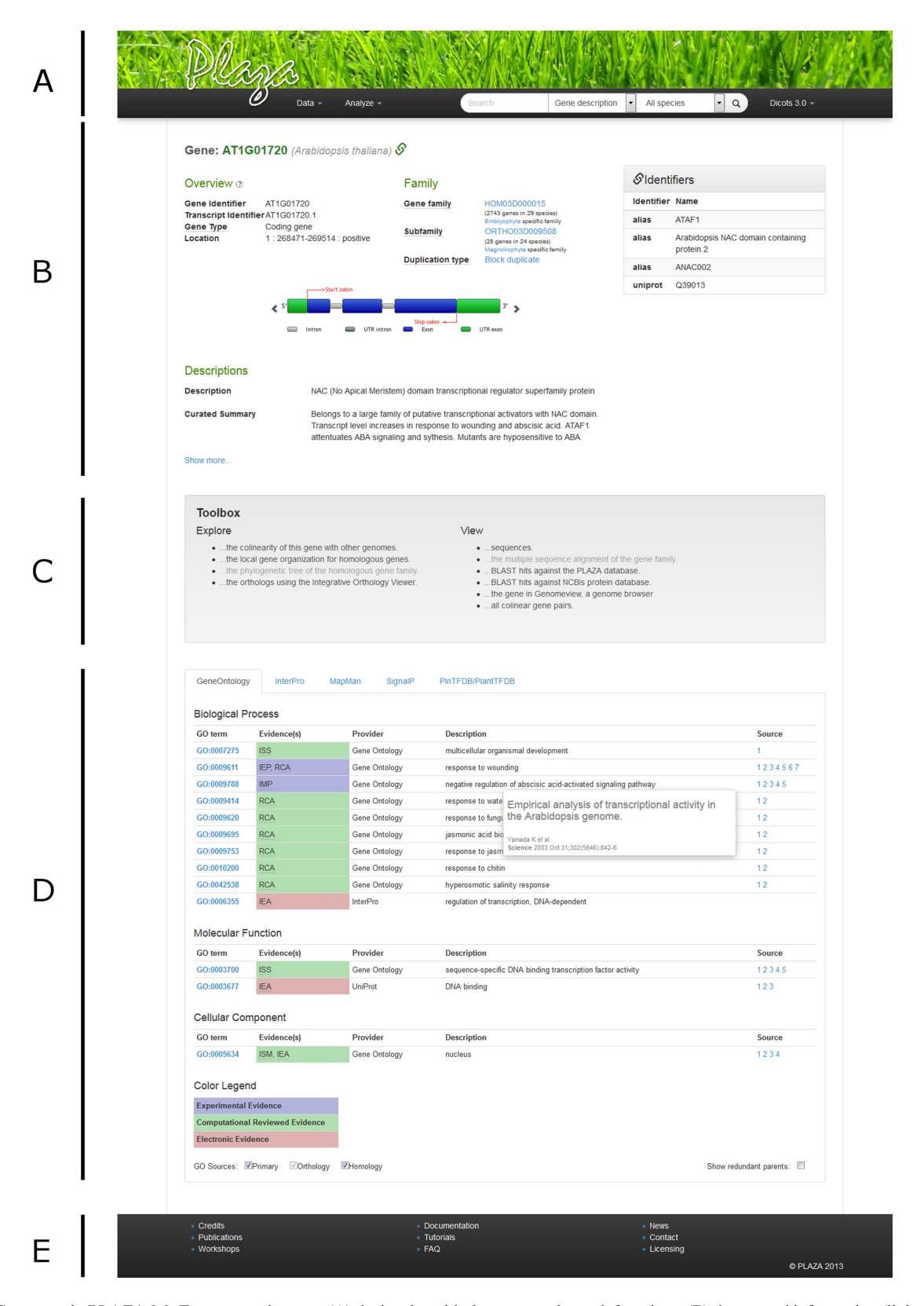
Figure 1. Gene page in PLAZA 3.0. From top to bottom, (A) the header with the menu and search functions, (B) the general information (links to the gene family, alternative gene names or identifiers) and Descriptions for gene AT1G01720, (C) the toolbox that allows different actions to be performed, (D) tabs with detailed functional information and (E) the footer with links to general information. A similar layout is consistently used on all pages describing different data types.