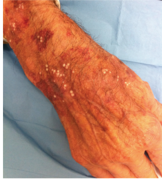
FIGURE 4: Purpura, milia and rubeosis steroidica induced by superpotent topical corticosteroids.

Special attention should be paid when applying topical corticosteroids in the presence of an infection, as there is a risk of exacerbation. Topical corticosteroids can inhibit the skin's ability to fight against bacterial or fungal infections. A common example of this inhibition is seen when a topical steroid is applied to an itchy groin rash. If this is a fungal infection, the rash gets redder, itchier, and spreads more extensively than a normal mycosis. The result is a tinea incognita, a rash with bizarre pattern of widespread inflammation [78].