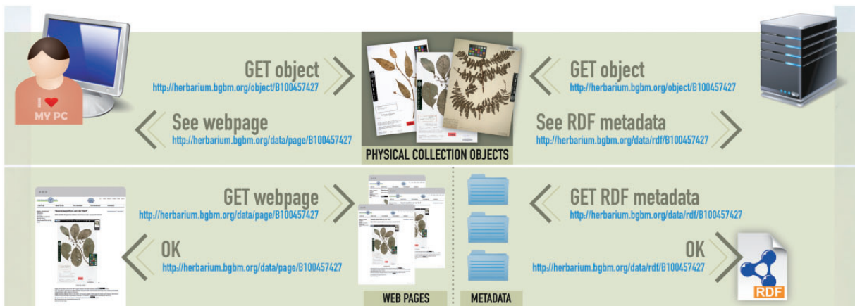
Figure 2. Basic redirection mechanisms. Human users are redirected to a human-readable web-representation of the specimens. Software systems are re-directed to a machine-readable metadata record.

collections. The awareness of the need for appropriate management procedures is already growing with the increasing use of CETAF stable identifiers in taxonomic workflows.