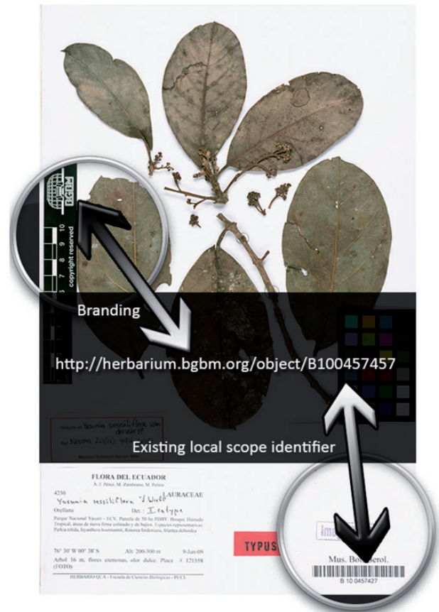
Figure 1. Example specimen. Example physical herbarium object and its stable HTTP URI identifier.

With the availability of CETAF stable identifiers, both physical and digital specimens and their associated information resources can be uniquely and persistently referenced. The distinction between the specimen itself and the information resources containing metadata describing this object (e.g. taxon name, collector and provenance) is occasionally omitted in oversimplified information models and data portals. However, this is a prerequisite for a consistent system, which enables different users to talk about the same specimen or discuss (and perhaps reject) claims made in different information resources about this specimen. Assertions that refer to objects by means of identifiers can be integrated and provide a basis for the inference capabilities of the Semantic Web. The identifiers' full potential unfolds with the implementation of redirection mechanisms. Users trying to access a specimen using a web-browser and the specimen identifier will be redirected to a human-readable representation of the objects, typically an HTML-webpage. On the other hand software-systems requiring machine-readable representations of the object will be redirected to a (preferably) RDF-encoded metadata record (Figure 2).