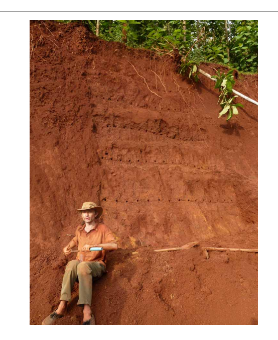
FIGURE 4 | Root sampling from an excavation (7 m deep) in Lao PDR (Maeght, 2009).

approaches, (ii) MRs, (iii) access shafts, and (iv) caves and mines. In addition, a short overview on (v) indirect approaches such as tracer studies is given.