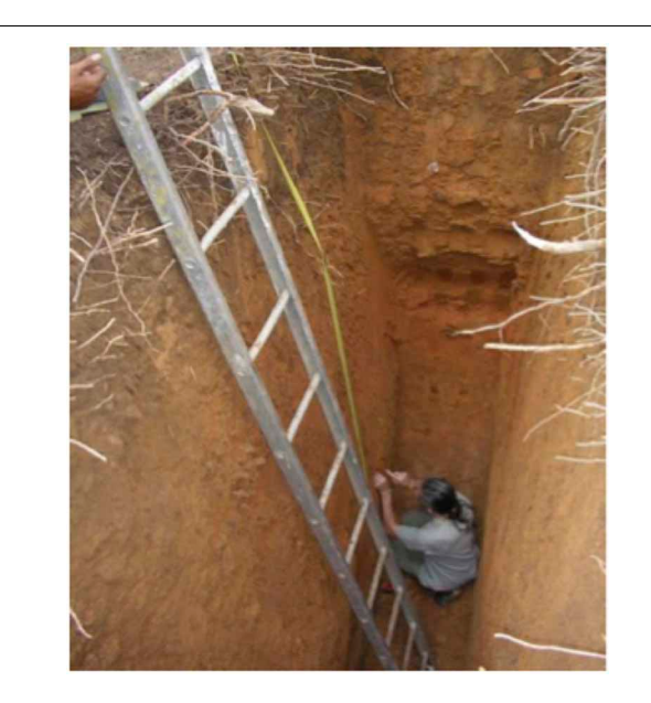
FIGURE 3 | Root mapping and collection in a trench (4 m deep) in Thailand (Maeght, 2009).