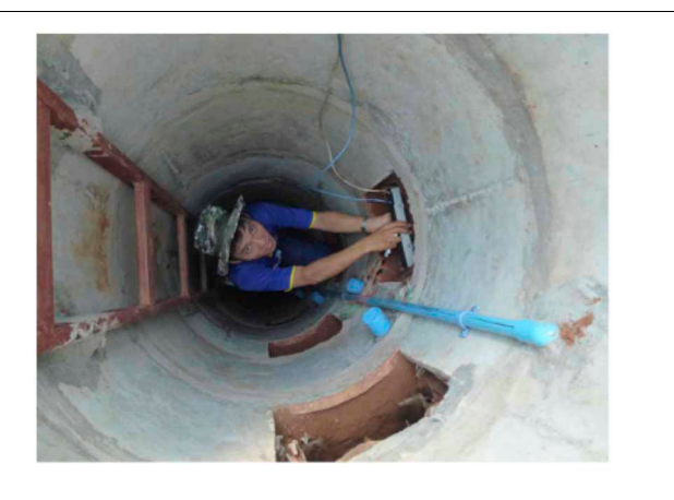
FIGURE 5 | Root scanning in access shaft (5 m deep) in Lao PDR (Maeght, 2012).

Despite advances in root studies in the last five decades, the most common methods used to obtain data on root distribution and structure have not changed substantially: excavation