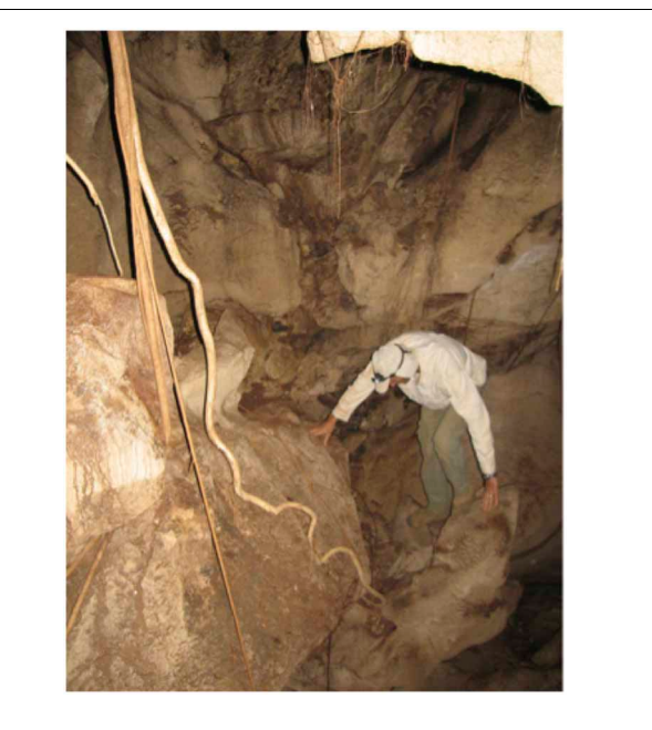
FIGURE 6 | Cave prospection (12 m deep) for root studies in Lao PDR (Pierret, 2010).

and coring techniques are still and by far the preferred methods. Recently, the term "shovelomics" was establish (Trachsel et al., 2010) to qualify simple but effective approaches to determine root phenotypes including maximum rooting depth. Excavation methods include manual digging and up-rooting, the use of various mechanical devices, explosives, and high pressure water or air (Weaver, 1919; Stoeckeler and Kluender, 1938; Mitchell and Black, 1968; Newton and Zedaker, 1981; Rizzo and Gross, 2000). Coring can be conducted manually by pushing or hammering sampling equipment into the soil using various devices from simple, sharpened steel augers to advanced cryogenic devices for sampling wetland soil (Cahoon