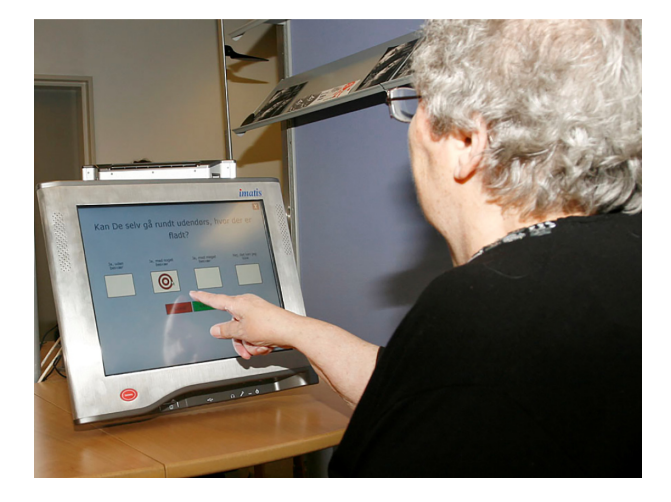
Figure I A patient using the touch screen. Note: Reprinted with permission from DANBIO.

The completeness of data is generally high (ie, 96%, 93%, 83%, 90%, and 93% for information on the name of the treating doctor, diagnosis, year of diagnosis, DAS28, and HAQ, respectively). National coverage of DANBIO is assessed annually in two ways: for patients in biological treatment by comparing to those registered in the patient record systems of each rheumatologic department (94% in 2013) and by