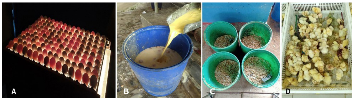
Figure 5. Hatchery wastes in Bangladesh. A) Candling of eggs in a hatchery that shows infertile eggs as clear eggs. B) Infertile egg fluid for dumping. C) Crushed eggshells after regular hatch out. D) Culled chicks immediately after hatch out.