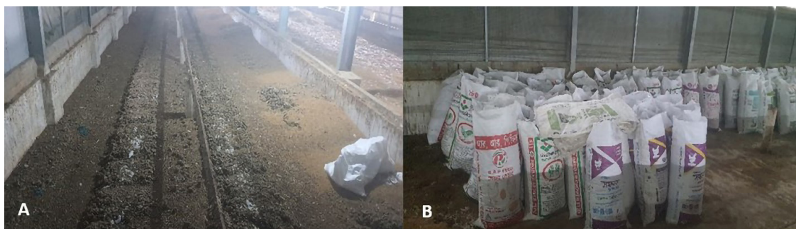
Figure 1. Poultry litter management in a slat cum floor system of a breeder farm in Bangladesh. A) Poultry excreta under the slat area for a period of 66 weeks. B) Collected excreta from the shed for sale.

Generally, the large poultry breeder companies, such as Aftab Bahumukhi Farms Ltd., Nourish Poultry and Hatchery Ltd., Kazi Farms Group, Nahar Agro Ltd., Provita, Paragon Group, and others, have strong relationships with local brokers who collect spent litter and sell it to crop and fish farmers. These companies manage their poultry in contact housing, either in floor or slat cum floor systems, or in cage systems, with birds kept for 64–66 weeks (broiler breeders), 72–80 weeks (layer breeders), and approximately 90 weeks (layers). They usually practice proper poultry waste management, primarily through composting (Fig. 1). The litter and/or manure remain in the shed until the birds are culled. In a cage system, farmers routinely scrub the litter and keep it in a compost pit (Fig. 2), while some farmers store it in an open field. Small-scale commercial layer and broiler farms