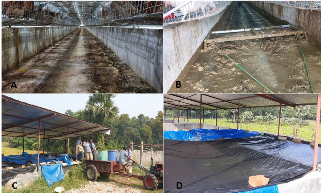
Figure 2. Poultry litter management in case of breeder or commercial layer farms in Bangladesh. A) and B) Litter for scrubbing out from the shed. C) Compost chamber. D) Anaerobic condition for preparing compost.

have haphazard poultry waste management, with the waste being utilized as fertilizer on neighboring agricultural land, piled at the roadside or near the shed, sold to the buyer, used as fish feed, or dumped in open areas (Fig. 3) without any treatment [3,27,58–60]. Due to economic effectiveness, farmers in the broiler production system frequently reuse their litter materials (rice husk) for two or more flocks, which result in poor quality poultry manure if not adequately dried, increasing the risk of disease outbreaks in that flock. In addition, litter from rural poultry farms is commonly deposited in nearby low-lying areas, resulting in greenhouse gas emissions as well as pollution of the water and air [25]. The majority of Bangladeshi poultry farms use litter as compost (52.78%), while others use it for fish feed (30.55%) and other purposes (8.33%). About 47.20% of the farms dispose of litter in pits, while 44.44% in open places, 5.56% on the roadside, and the rest 2.78% in other places, as reported previously [61]. Furthermore, poultry waste is disposed of in agricultural fields, open disposal pits, or open drains, and poultry carcasses are routinely disposed of or thrown near poultry sheds, where dogs and foxes scavenge for food [44,59].