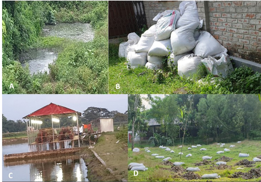
Figure 3. Traditional waste management practices in commercial layer and broiler farms in Bangladesh. A) Waste passing directly to the open pit. B) Before being sold, the litter is collected and stored beside the shed. C) Integrated layer and fish farm where the litter directly goes to the pond. D) Litter used in a nearby agricultural land.