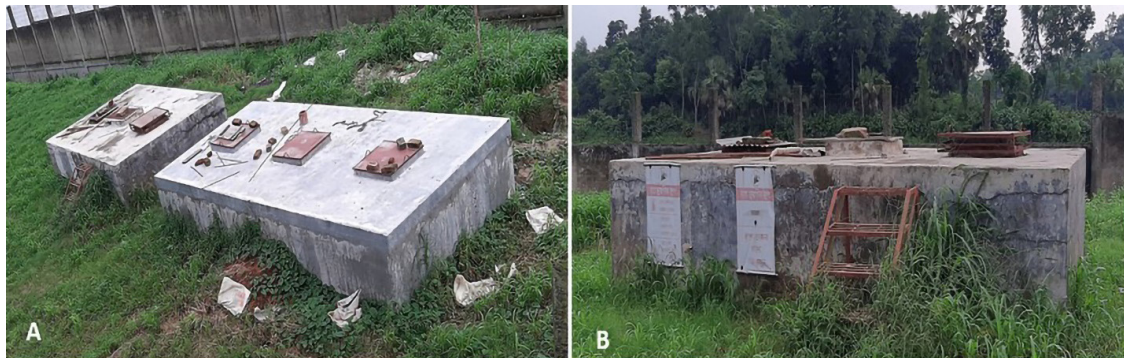
Figure 4. Disposal pit for dead and culled birds of a breeder farm in Bangladesh. A) Top view. B) Side view.