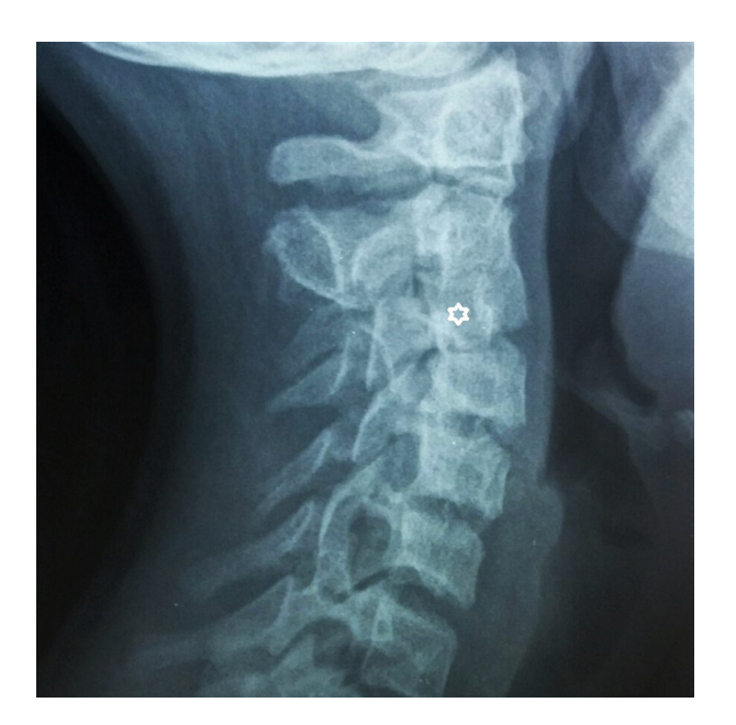
Figure 1. Static lateral X-ray of the cervical spine. The C3 hemivertebra is marked with a white asterisk.

Hemivertebra is a congenital failure in the formation and fusion of vertebral body ossification nuclei, resulting in the development of one side of the vertebral body. Its incidence is estimated at ~0.3 per 1000 live births [1].