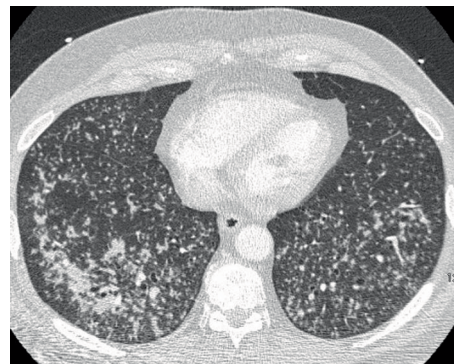
FIGURE 1: Computer tomography of the chest with contrast demonstrating bilateral diffuse centrilobular micronodular infiltrations with features of the tree-in-bud pattern.