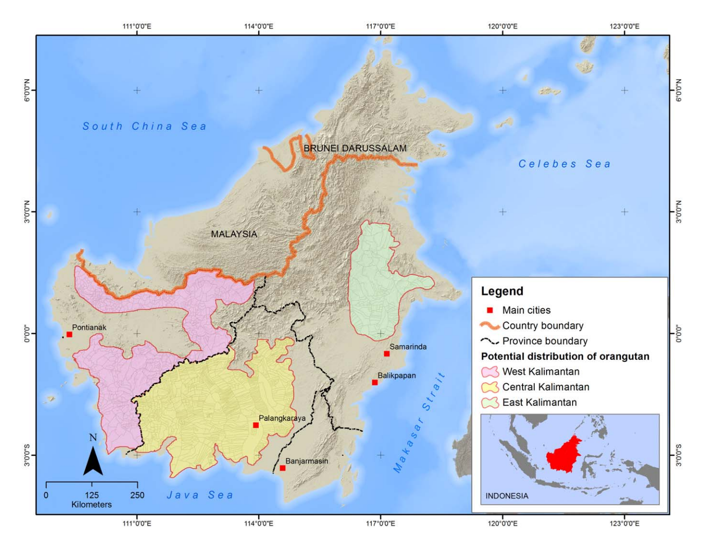
Figure 1. Potential distribution area of orangutan in Central Kalimantan (yellow), West Kalimantan (purple) and East Kalimantan (green), and the village area boundaries within these regions. doi:10.1371/journal.pone.0027491.g001