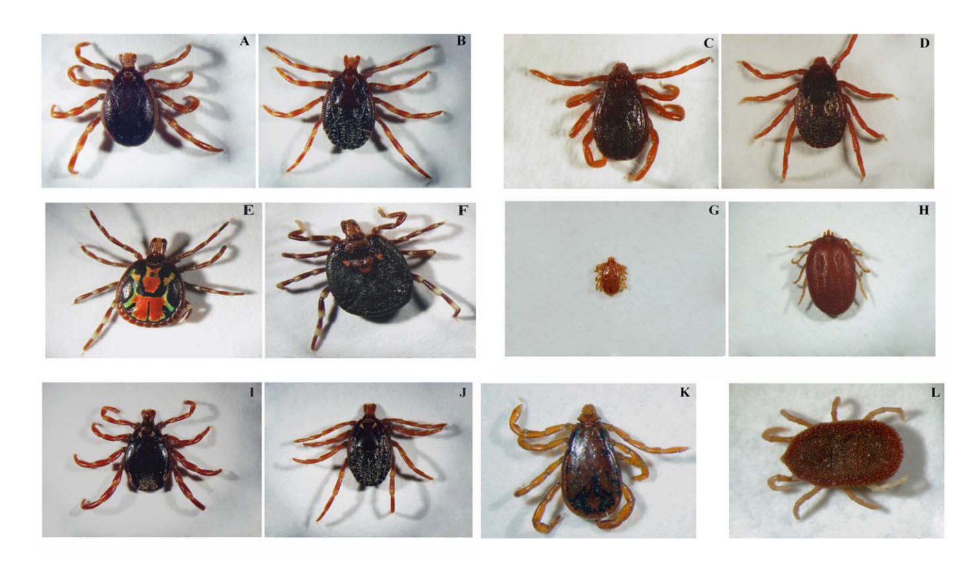
Figure 2. Ticks collected and studies. Hyalomma marginatum rufipes, male (A), female (B); Rhipicephalus evertsi evertsi, male (C), female (D); Amblyomma variegatum, male (E), female (F); Rhipicephalus (Bophilus) decoloratus, male (G), female (H); Hyalomma truncatum, male (I), female (J); Rhipicephalus guilhoni, male (K); Ornithodoros sonrai (L). doi:10.1371/journal.pntd.0000654.g002

burnetii (Table 3). The average age was 20.2\pm17.4 years with a range of 6.8 to 46.4 years. Eight had only a low titer (1/50) of total antibodies. One had serological evidence of chronic Q fever with titers of IgG of 1/1600 and 1/3200 with C. burnetii I and II phase respectively. We also tested 35 serum samples from the same patient (a girl born in 2001) collected regularly from July 2003 to June 2009. Seroconversion occurred between March 2007 and August 2007. In Dielmo villagers the seroprevalence was significantly higher (p<10<sup>-3</sup>), with 59 (24.8%) being positive: 22 (average age 21\pm16.2 , from 5.6 to 67.4) had a titer of total Ig of 1/50 and 37 (15.9±10.9) were above this. The mean age of the seropositive population (17.8±13.2) was lower (p<0.003) than the mean age of the studied population (26±18). Nine villagers had serological data suggesting recent infection with the presence of IgM (1/100 or higher), and their average age (14.9±7.5 years, 8 to