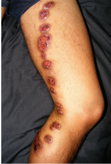
FIGURE 1: Lymphocutaneous sporotrichosis. Noduloulcerative lesions appear along the lymphatics proximal to the initial inoculation injury site.