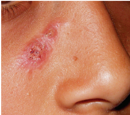
FIGURE 2: Fixed cutaneous sporotrichosis. A crusted/verrucous plaque develops at inoculation site, seen here over face of a child.

papulopustules, nodules, or verrucous plaques and occasionally nonhealing ulcers or small abscesses. The lesions may resemble keratoacanthoma, facial cellulitis, pyoderma gangrenosum, prurigo nodularis, soft tissue sarcoma, basal cell carcinoma, erysipeloid, or rosacea [14, 36, 37]. This form is considered to occur usually among hosts having high resistance wherein minimal lesions may subside spontaneously or persist exceptionally if not treated, and responds better to treatment [15, 38].