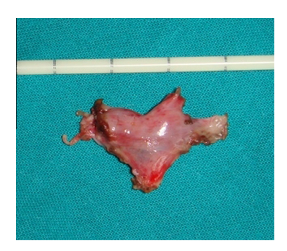
Figure 2 The excised Müllerian structures.

The mean (range) follow-up was 18.2 (3–42) months and clinically, all 32 operated testes retained their scrotal positions. One right testis was high scrotal; the patient