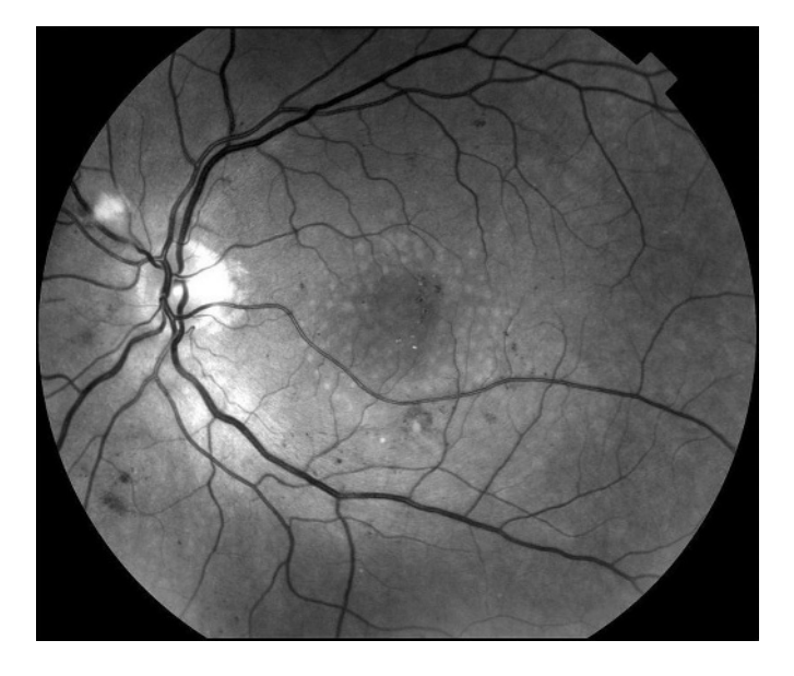
Figure 2 Red free fundus photographs of a macular grid applied using the Pascal pattern in diffuse diabetic macular oedema. Notice the evenly distributed burns.

allowed us to directly compare the laser power needed using a 100 ms burn for the conventional treatment with the laser power needed for the same eye during the Pascal episode using a 20 ms burn. The average power with the conventional photocoagulator for these 22 procedures was 235 mW (SD 57.2, range 170–400), and the mean number of burns was 738 (SD 231.2, range 320–1178). The Pascal parameters used for these 22 procedures were as follows: mean power was 396 mW (SD 100.2, range 250–750), and the mean number of burns was 1116 (SD 417.2, range 500–2063). The difference in powers used with the conventional and the Pascal lasers for these 22 patients was highly significant (p<0.001), being 396 mW for Pascal compared with 235 mW for conventional laser. Though not specifically looked at in this study, it was generally