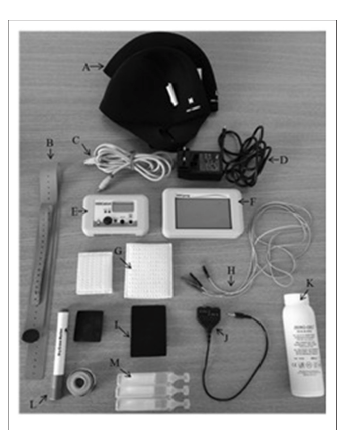
FIGURE 1 | tDCS equipment for the HDC Kit. (A) Neoprene swimming caps for securing electrodes, (B) straps for securing electrodes, (C) programmer/stimulator connector cable, (D) power supply, (E) tDCS stimulator (batteries inside), (F) tDCS stimulator parameter programmer, (G) sponge holding bags, (H) electrode cables (red—anodal; black—cathodal), (I) rubber electrodes, (J) cable connector, (K) conductive EEG gel, (L) measuring equipment (washable pen and measuring tape), (M) saline (20 ml pouches for easy application). Not all tDCS kits come with a separate stimulator and parameter programmer.

reapplying saline to the holding bags, or by parting the hair beneath electrodes more sufficiently.