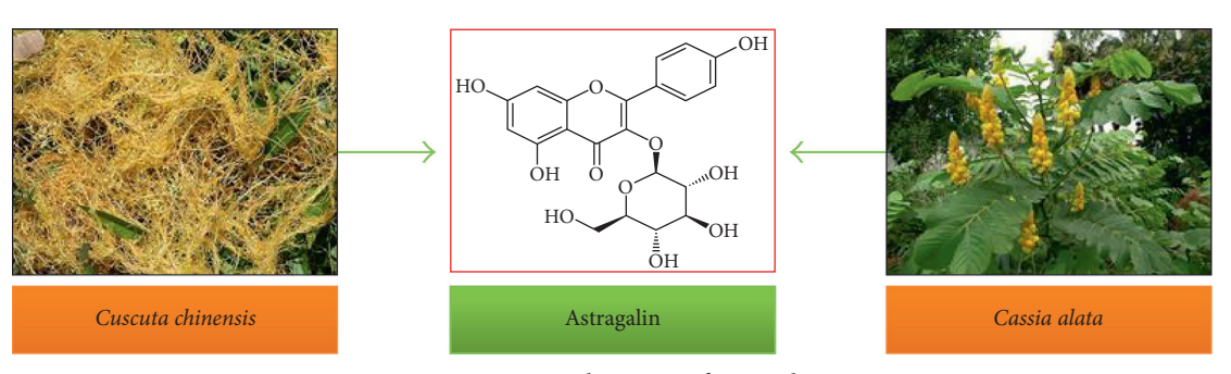
FIGURE 1: Natural sources of astragalin.

properties that contribute towards their multitargeted action [8]. A lot of plant-derived bioactive compounds are used for the cure as well as for the prevention of several diseases. Among these compounds are the polyphenols consisting of alcohols with \geq 2 benzene rings and \geq 1 hydroxyl group. These polyphenols have a range from simple structural molecules (flavonoids and phenylpropanoids) to highly complex compounds (lignins and melanins). Reports have suggested that polyphenols in general and flavonoids in particular exhibit various biological effects like antiallergic, antibacterial, anti-inflammatory, antiviral, antithrombic, hepatoprotective, antibacterial, and antioxidant activities [9].