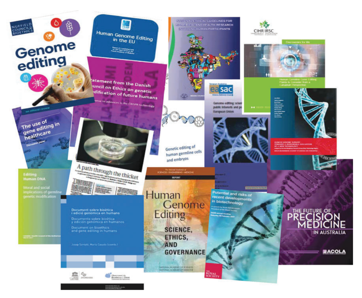
FIG. 1. Cover Story: More than 60 official reports and statements about the ethics of germline editing have been published within the past three years.

conditional conclusion,<sup>1</sup> noting that trials would be acceptable if technical challenges of the research were resolved, the risk/benefit ratio of the proposed research were reasonable, and a "robust and effective regulatory framework" were established that would include the following: