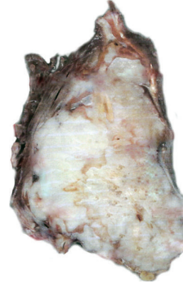
FIGURE 2: Macroscopic picture of leiomyosarcoma of vascular origin.

3.2. Treatment. The treatment plan for each patient was determined by a multidisciplinary team. Three patients with advanced disease at diagnosis were treated with palliative intent while 13 patients were treated with curative intent with surgery involving resection and/or without vascular