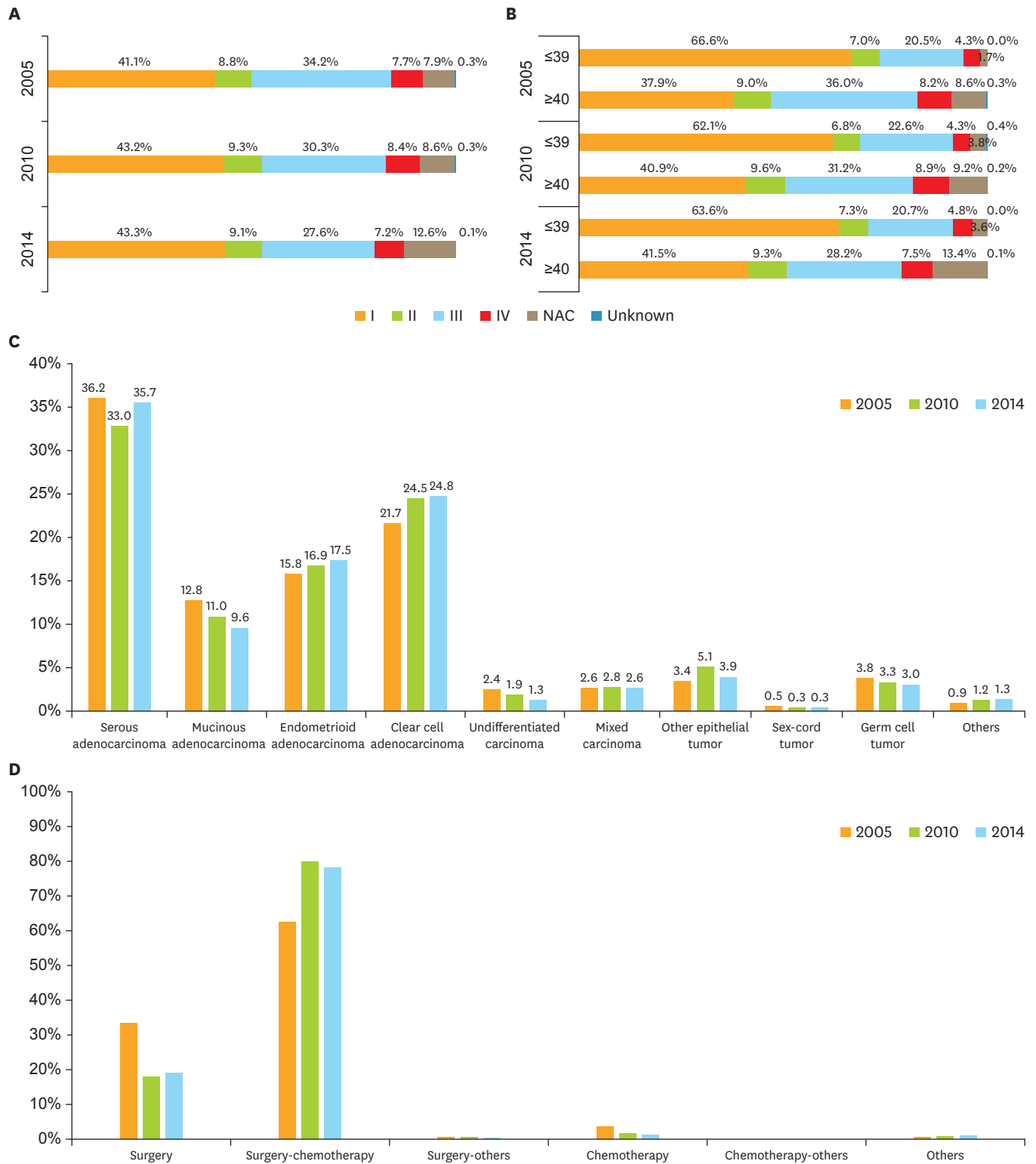
Fig. 4. Characteristics of ovarian malignant tumor. (A) Distribution of post-surgical stages in ovarian malignant tumor. (B) Distribution of post-surgical stages in younger and older patients with ovarian malignant cancer. (C) Distribution of histological types in ovarian malignant cancer. (D) Distribution of treatment methods in ovarian malignant cancer.