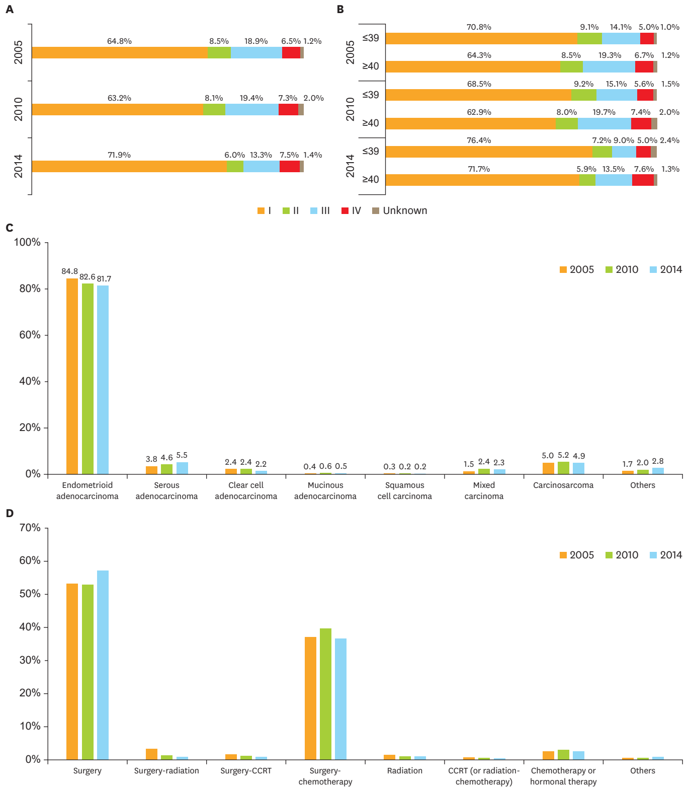
Fig. 3. Characteristics of endometrial cancer. (A) Distribution of post-surgical stages in endometrial cancer. (B) Distribution of post-surgical stages in both younger and older patients with endometrial cancer. (C) Distribution of histological types in endometrial cancer. (D) Distribution of treatment methods in endometrial cancer.