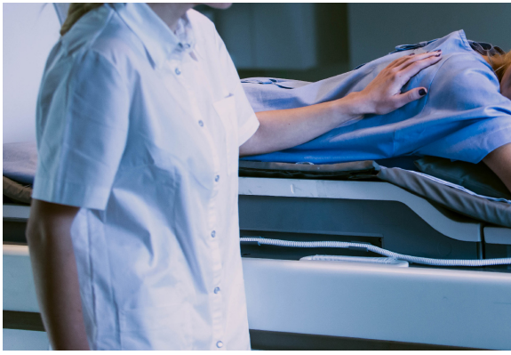
Figure 5 Photograph depicting a patient lying in the prone position on the magnetic resonance (MR) table.

Notes: The focused ultrasound transducer array is located within the MR table, and the patient is positioned such that the fibroid overlies the ultrasound transducer.