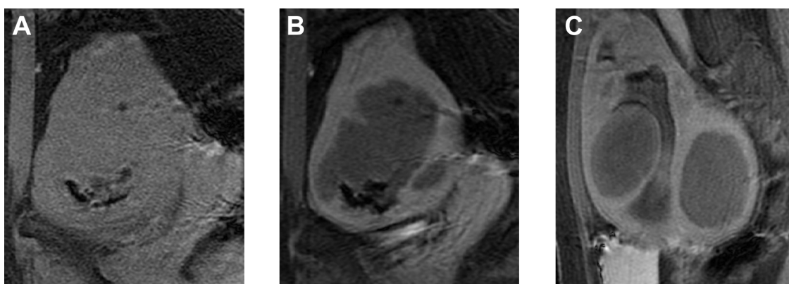
Figure 2 Examples of MRgFUS screen failures.

The MRgFUS is planned and performed with the patient in a prone position (Figure 5). The patient lies on a custom-built patient-scanner table, which houses all of the electronics and the phased array transducer in a sealed water bath. This table docks to the magnet. To ensure good acoustic coupling with the patient's abdomen, a gel pad is placed between the transducer and the patient's skin. A mixture of degassed water and US gel is applied to both sides of the gel pad to avoid air bubbles. Multiplanar T2-weighted images are taken of the pelvis, and are transferred to the ExAblate/Sonalleve planning program. The region of treatment is manually drawn and defined within the capsule of the fibroid. The target volume is analyzed with superimposed US-beam paths in all three planes. By angling the beam path, the target can be optimally accessed and unwanted heating can be avoided. When bowel