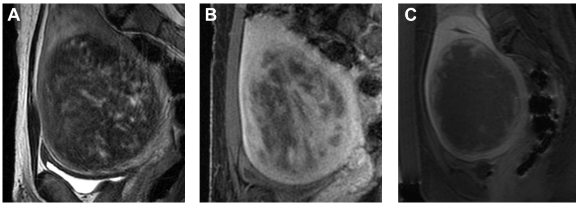
Figure 1 Sagittal MRI of a typical case pre/post treatment.

Notes: (A) Sagittal T2-weighted image (T2WI) demonstrating a single uterine fibroid of predominantly low signal intensity, accessible by the ultrasound transducer, which is imbedded in the magnetic resonance table. (B) Sagittal T1-weighted image (T1WI) postcontrast at screening demonstrates heterogeneous enhancement of the fibroid. (C) Sagittal T1WI postadministration of intravenous contrast after MRgFUS treatment demonstrates lack of enhancement in the fibroid, consistent with treatment effect.