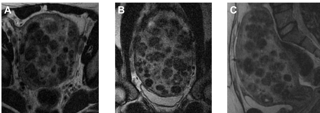
Figure 3 Example of MRgFUS screen failure due to innumerable small fibroids.

Notes: (A) Axial, (B) coronal, and (C) sagittal T2-weighted image of a patient with innumerable, small uterine fibroids, without a definite dominant fibroid. Cases such as these are not good candidates for MRgFUS.