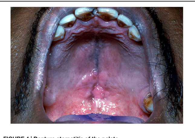
FIGURE 4 | Denture stomatitis of the palate.

It was previously referred to as "HIV-gingivitis" since its typical occurrence was in HIV associated periodontal diseases ( Figure 6 ). It manifests as linear erythematous band of 2–3 mm on the marginal gingiva along with petechial or diffuse erythematous lesions on the attached gingiva. The lesions may present with bleeding. In addition to C. albicans , C. dubliniensis