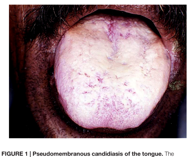
copyright of the images is owned by Prof. Anil and a written consent was obtained for the Figures 1–6 .

The involvement of both oral and oesophageal mucosa is prevalent in AIDS patients. The symptoms of the acute form are rather mild and the patients may complain only of slight tingling sensation or foul taste, whereas, the chronic forms may involve the oesophageal mucosa leading to dysphagia and chest pains. Few lesions mimicking pseudomembranous candidiasis could be white coated tongue, thermal and chemical burns, lichenoid reactions, leukoplakia, secondary syphilis and diphtheria (Lalla et al., 2013).