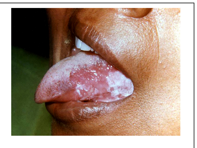
FIGURE 3 | Hyperplastic candidiasis at the lateral border of the tongue.

with varying degrees of dysplasia (Williams and Lewis, 2011). A confirmed association between Candida and oral cancer is yet to be recognized, although in vitro studies have shown that the candida organisms can generate carcinogenic nitrosamine (Farah et al., 2010; Sanketh et al., 2015). A small percentage of cases occur in association with iron and folate deficiencies and with defective cell-mediated immunity. Differential diagnosis may include leukoplakia, lichen planus, angular cheilitis and squamous cell carcinoma.