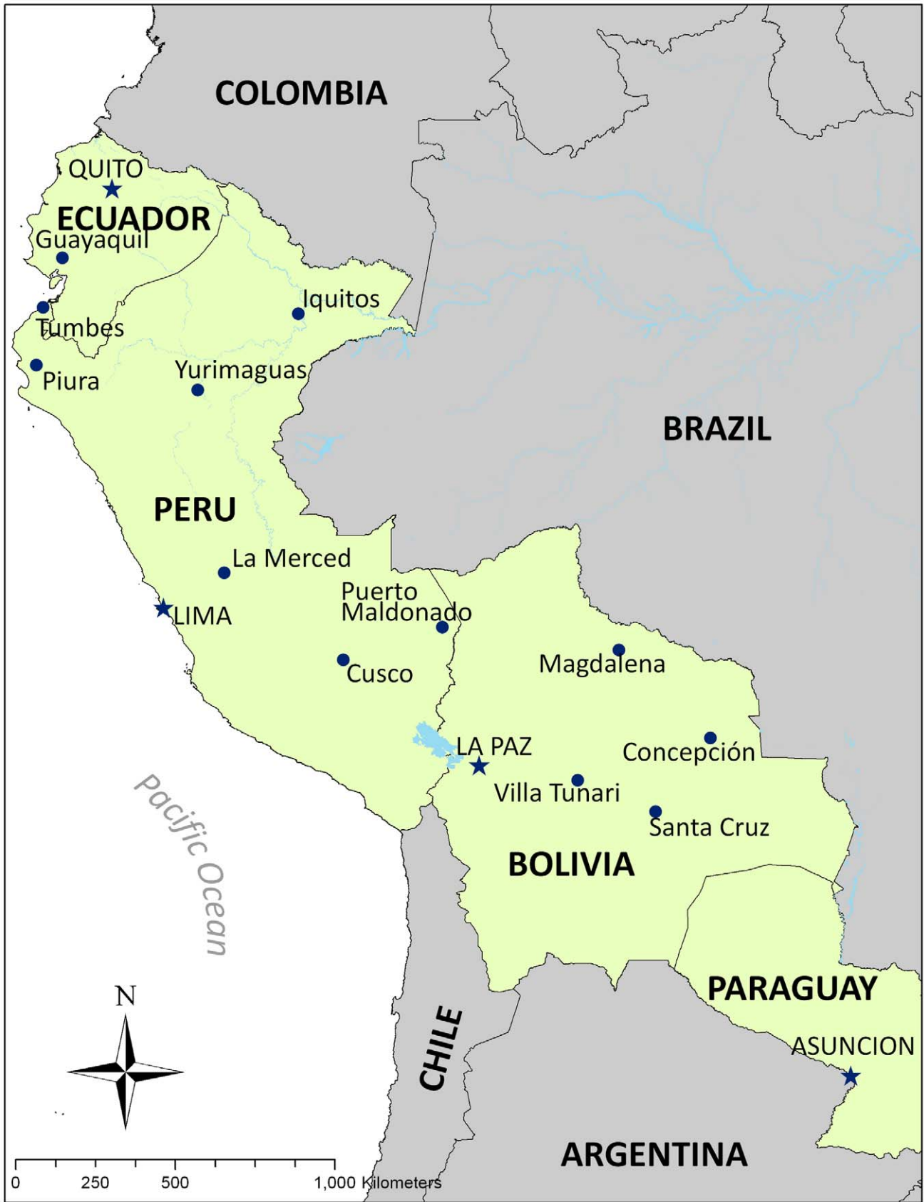
Figure 1. Map of study sites in Ecuador, Peru, Bolivia, and Paraguay. Capitals of Ecuador (Quito), Peru (Lima), and Bolivia (La Paz) are shown for reference. doi:10.1371/journal.pntd.0000787.g001