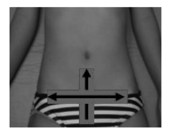
Fig. 1. Kinesio taping method

parous women in their twenties and thirties without pathologic findings in the pelvic cavity, whose menstrual pain scores were five or higher on a visual analogue scale (VAS). The subjects were randomly divided into a Kinesio taping group, for which Kinesio tape was applied to the abdominal and lumbar areas of the subjects, a spiral taping group, and a control group. Of the initial 42 subjects, 34 were after excluding eight, whose menstrual due date did not correspond with the time of research or who did not fully engage in the program (Table 1). After menstruation ended, degrees of menstrual pain and premenstrual syndrome were measured again.