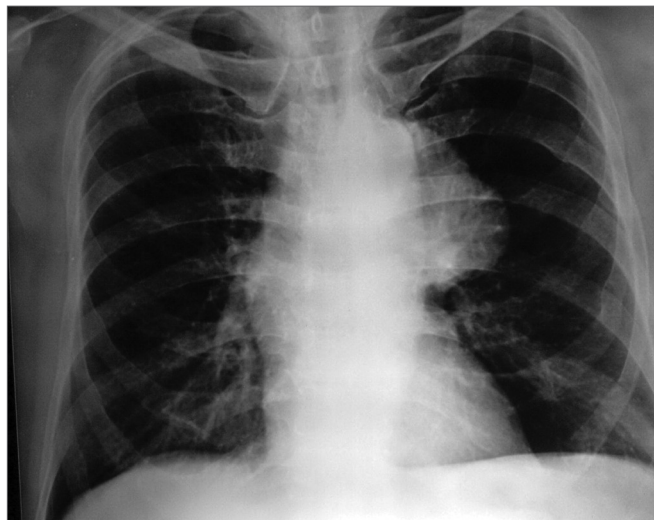
Figure 1. Chest X-ray PA view showing well- defined lobulated mediastinal lesion on the left side.

A 55-year old male patient presented with hoarseness of voice of 8 months duration. He was a chronic smoker and previously diagnosed to have chronic obstructive pulmonary disease with recurrent attacks of dyspnoea and cough for the last 20 years. He reported swelling of the legs for the last 2 months. On examination, there were signs of chronic systemic venous congestion. Cardiac apex was found in the left 5 th intercostal space, 1cm lateral to mid-clavicular line. A left parasternal heave was noted with a palpable pulmonary component of second heart sound. On auscultation, the first heart sound was normal. The pulmonary component of second heart sound was accentuated. Indirect laryngoscopy revealed a paralysed left vocal fold. Chest X-ray showed findings suggestive of chronic obstructive pulmonary disease (COPD) with chronic cor pulmonale. Echocardiography showed a dilated