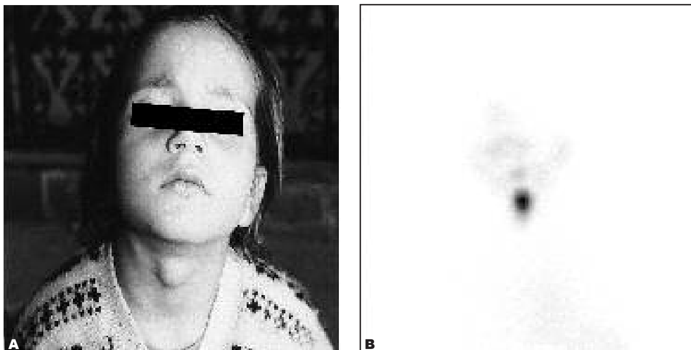
Fig. 1. A 5-year-old girl with neck swelling. (A. Clinical photograph shows the midline neck swelling. B. Tc-99m pertechnetate thyroid scan shows a focus of abnormal radiotracer uptake in the subhyoid region and another very faint focal uptake in the sublingual region without any evidence of radiotracer uptake in the normal thyroid position in the anterior view. )

The ETT is seen at any age, but mostly noted at adolescence or after pregnancy due to the increased physiological demand of thyroid hormones. 1 Hormone production from ETT is usually insufficient, leading either to a subclinical or clinical hypothyroid state. It results into increased secretion of TSH from the pituitary gland in response to the hypothalmo-pituitary axis. Increased TSH level causes follicular cell hyperplasia of the ectopic thyroid tissue and visible swelling in front of the neck anywhere along the path of descent of thyroid primordium may be noted. The TSH stimulation may not have similar effect on different foci of ectopic thyroid tissue and they may have disproportionate growth. 4 Usually the patients complain of a palpable mass, growth retardation and lump sensation in the throat. Patients may have dyspnea, stridor