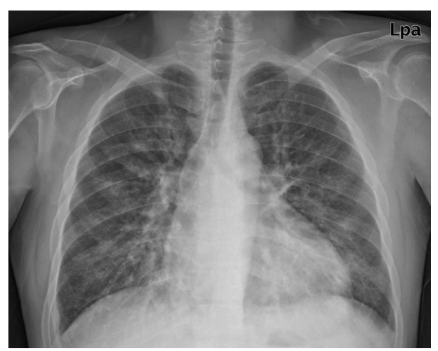
Fig. 1. Chest radiograph showing infiltration in both lower lobes and cardiomegaly.

A renal biopsy and bronchoscopy were promptly performed. Bronchoscopic examination showed mild hyperemia in both bronchi, with red bronchial alveolar lavage fluid. Light microscopic examination of the renal biopsy showed proliferative endarteritis in interlobular arteries and fibrinoid necrosis and intramural thrombi of small arterioles without crescent formation or necrotizing lesions, consistent with hypertensive nephrosclerosis (Fig. 3). Steroid therapy was rapidly decreased and stopped. A trans-bronchial lung biopsy showed macrophage infiltration into alveolar spaces and goblet cell metaplasia in bronchial mucosa generally seen in heavy smokers. Vanillyl-mandelic acid, metanephrine, epinephrine, and norepinephrine in 24-h urine samples were within normal levels. Tests for anti-glomerular basement membrane antibody and anti-neutrophil