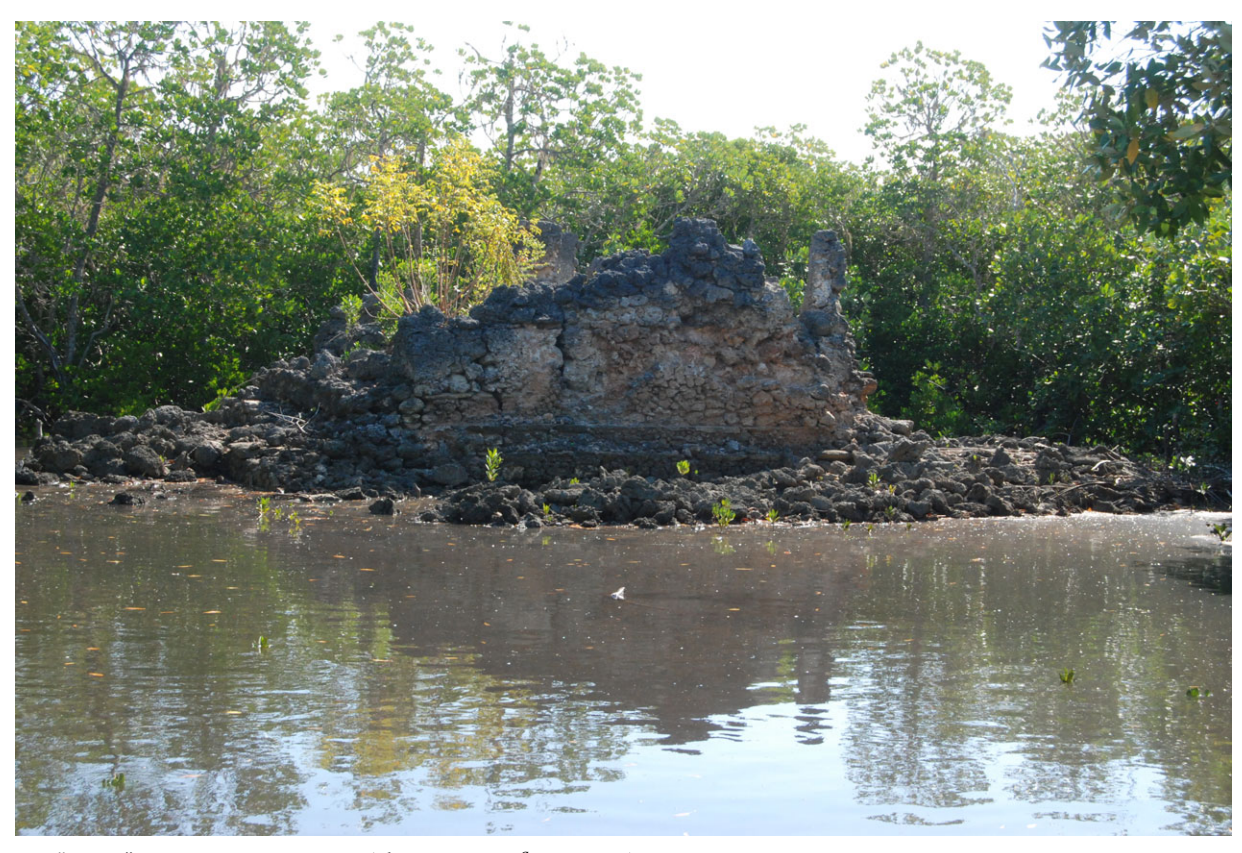
FIGURE 3. "Mnara" mosque at Songo Mnara.