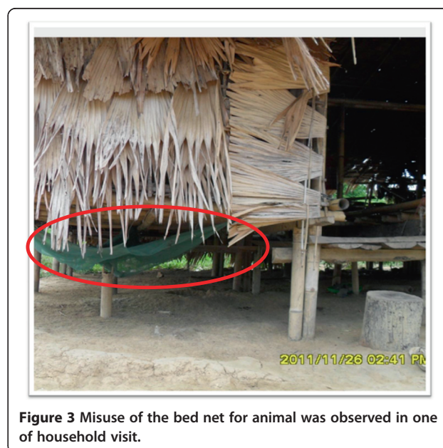
Figure 3 Misuse of the bed net for animal was observed in one of household visit.

Universal coverage remains the goal for all people at risk of malaria especially in migrant plantation workers. Free distribution of the ITN/LLINs is crucial to the success of maintaining universal coverage of bed nets in Myanmar. To further improve coverage and effective utilization of ITN/LLINs among migrant workers, regularly updated, interactive, comprehensive national advocacy, IEC/BCC activities, and operations research feeding into and provid-