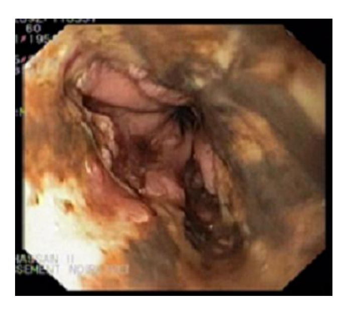
Figure 2 : Endoscopic view showing of the middle and lower third of the esophagus, which had circumferentially black pigmentation: the mucosa was black and covered by an exudate of the same color