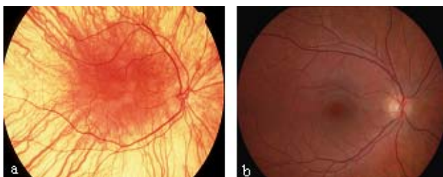
Figure 1 Fundus picture of a patient with albinism (a) and fundus picture of a normal eye (b).

ity is 2/10. This phenotype was previously known as yellow albinism.