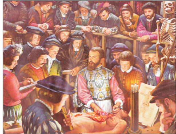
Fig. 3. Andreas Vesalius undertaking an anatomical lecture in Padua. A notable shift from the prevalent trend in medieval Italy as he is dissecting the human body himself. He is referring to Galen's text (prevalent textbook in anatomy in those days) which is open by the side of the cadaver. Vesalius is surrounded by his students in Padua and the general public viewing the dissection from the gallery. Image in public domain.