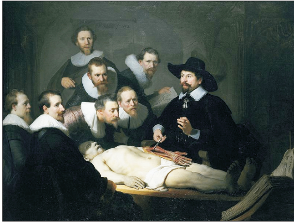
Fig. 4. The anatomy lesson of Dr. Nicolaes Tulp, official city anatomist of the Amsterdam Guild of Surgeons, drawn by Rembrandt in 1632. Anatomical dissection sessions were social events in those days being attended by students as well as the general public on payment of an entrance fee. All the spectators were properly dressed for a solemn social occasion. Image in public domain.

spread beyond the boundaries of the universities among the general population leading to public dissection sessions being attended by huge crowds and subsequent establishment of anatomical theatres (Fig. 4) [17, 43].