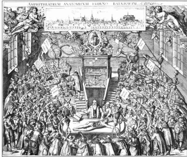
Fig. 2. An anonymous engraving of an anatomical dissection session being conducted in full public view in the anatomical theatre in University of Leiden (the Netherlands) which was built in 1596. The illustration is based on a drawing by J.C. vant Woudt in 1609. Image in public domain.