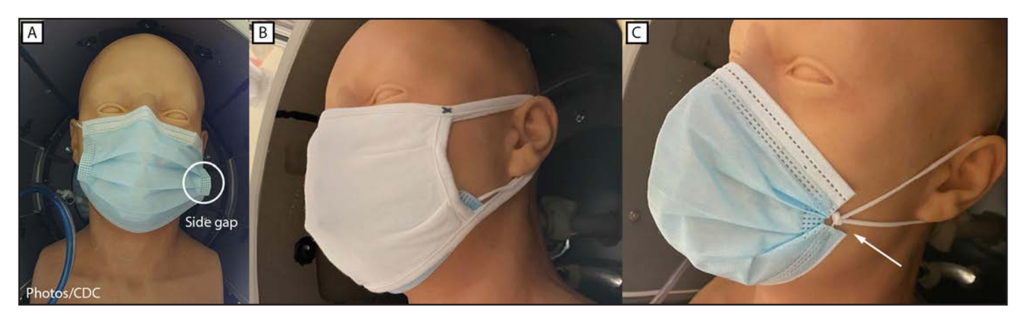
FIGURE 1. Masks tested, including A , unknotted medical procedure mask; B , double mask (cloth mask covering medical procedure mask); and C , knotted/tucked medical procedure mask

These laboratory-based experiments highlight the importance of good fit to maximize overall mask performance. Medical procedure masks are intended to provide source control (e.g., maintain the sterility of a surgical field) and to block splashes. The extent to which they reduce exhalation and inhalation of particles in the aerosol size range varies substantially, in part because air can leak around their edges, especially through the side gaps (9). The reduction in simulated inhalational exposure observed for the medical procedure mask in this report was lower than reductions reported in studies of other medical procedure masks that were assessed under similar experimental conditions, likely because of substantial air leakage around the edges of the mask used here (10). In