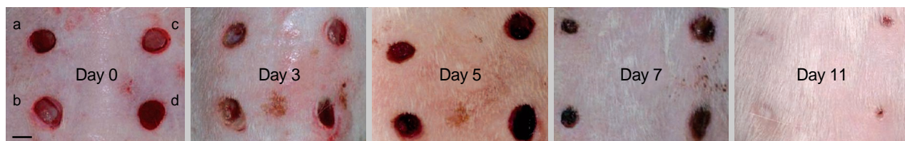
Fig. 1. The effects of ozonated olive oil on clinical wound closure. The photomicrographs demonstrate the enhanced wound closure, in the ozone group, on the left two wounds (a and b) on the back of the guinea pig, as compared to the oil group (c) as well as the control group (d). (Bar=5 mm).

As shown in Fig. 1, there was an enhanced wound closure in the ozone group of wounds, the left two of the four wounds, as compared to the oil group as well as the control group. On