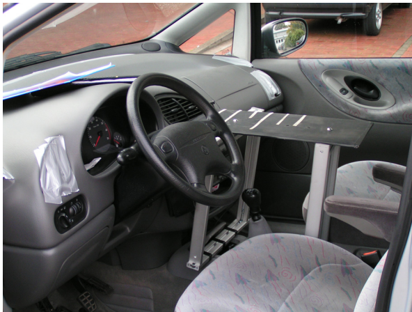
Figure 1 Preparation of study vehicles. Air outlets, that do not get sampled, are sealed by tape. An adjustable board is placed between the front seats.