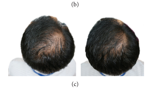
FIGURE 2: Representative photographs of patients at baseline and after 24 weeks of treatment with PSO.

were rated as unchanged relative to baseline and 44.1% (17/37) were rated as slightly or moderately improved (Figure 2). On the other hand, at 24 weeks, 28.2% (11/39) of subjects in the control group were assessed to have worsened based on the investigator; 64.1% (25/39) were rated as unchanged relative to baseline and 7.7% (3/39) were rated as slightly or moderately improved. These results showed significant intergroup differences (data not shown, P = 0.002 by chi-square test).