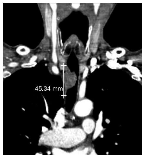
Fig. 1. A tracheal mass of about 4.5 cm length was observed at the mid-trachea by computed tomography.

A 52-year-old man was referred for a tracheal mass. He had dyspnea for the past 10 months. The dyspnea had become aggravated 2 weeks earlier, and blood-tinged sputum developed simultaneously. Computed tomography revealed about a 4.5-cm mid-tracheal mass obstructing 80% of the tracheal lumen (Fig. 1). Infiltration to the adjacent tissue was suspected. However, there was no enlarged regional lymph node. The mass showed mild FDG uptake on positron emission tomography. On fiber-optic bronchoscopy, a protruding mass with an irregular surface was found at the mid-trachea. The mass was hypervascular and fragile. A biopsy was omitted due to the risk of bleeding and respiratory insufficiency. The clinical impression was adenoid cystic carcinoma of the trachea. In the operating room, an endotracheal tube was positioned proximally to the mass through the nasopharyngeal route by a bronchoscopic guide in deep sedation status with